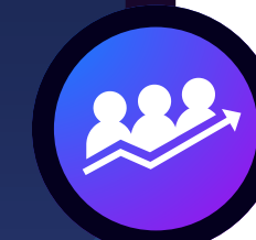
Exhibit to expand your professional network, connecting with industry leaders, potential clients, and collaborators.